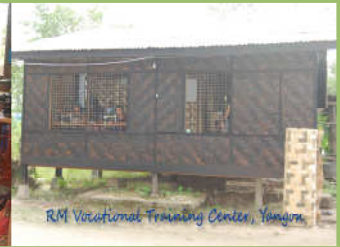
Ministry in Burma